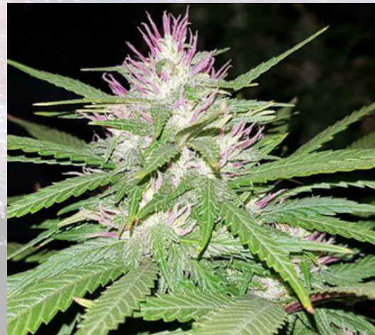
MAZAR-I-SHARIF NORTHERN AFGHANISTAN