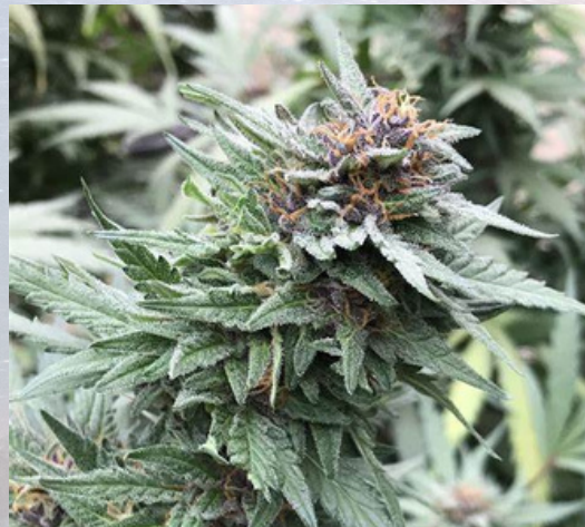
HINDU KUSH CENTRAL, SOUTH ASIA