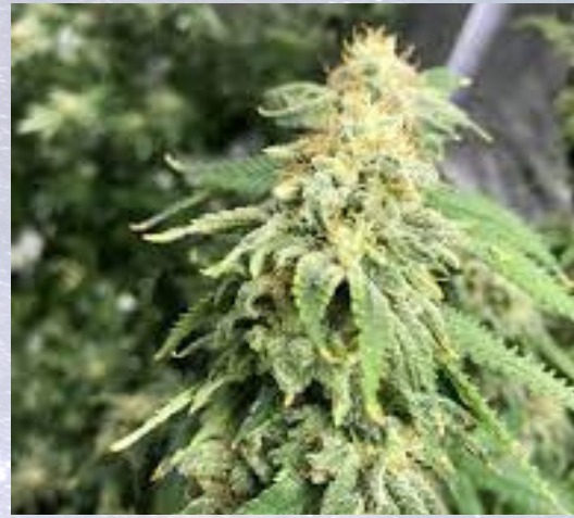
BIG BUDDHA CHEESE CHEESE X SKUNK 1 X AFGHANI