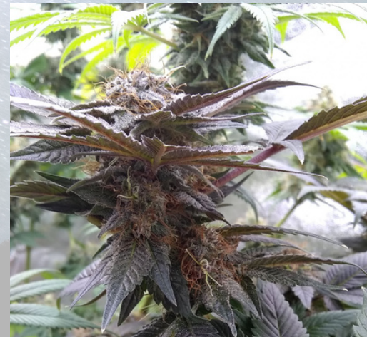
TASHKURGAN NORTHERN AFGHANISTAN