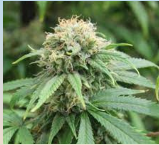
SUPER SILVER HAZE