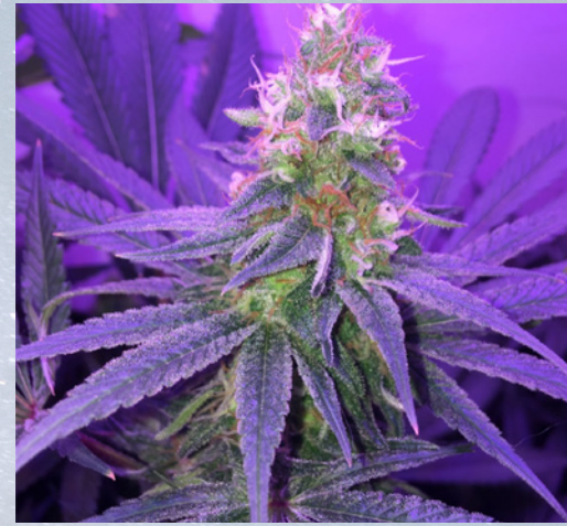
BLUEBERRY AFGHANI X FRUITY JUICE