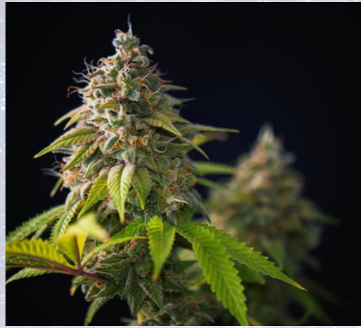
GORILLA GLUE SOUR DUBB X CHEM SIS