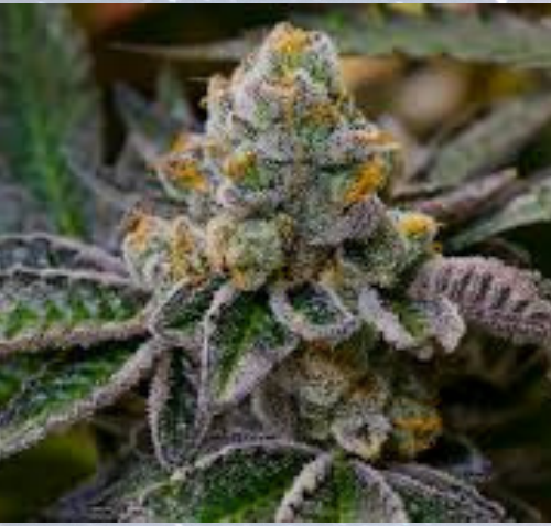
GIRL SCOUT COOKIES OG KUSH X DURBAN POISON